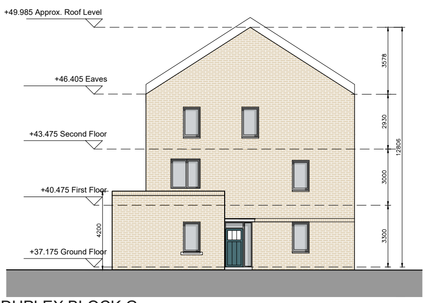
DUPLEX BLOCK G SIDE ELEVATION (EAST)