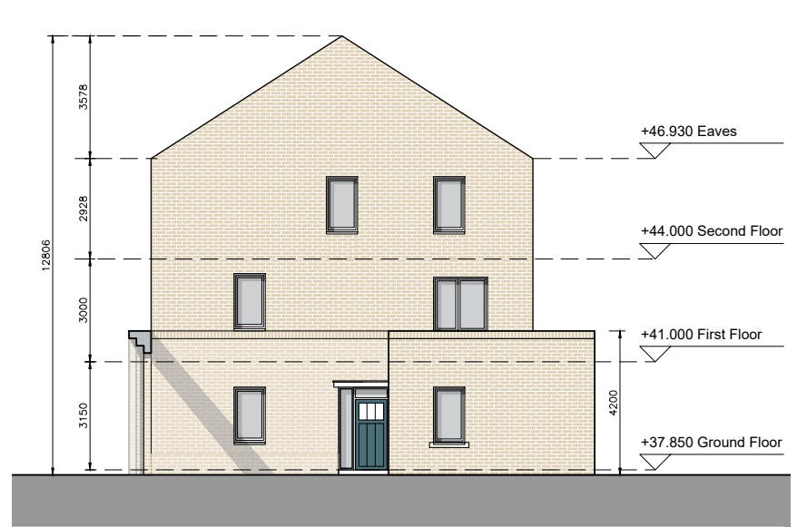
DUPLEX BLOCK G SIDE ELEVATION (WEST)